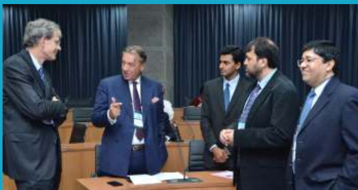
Networking at the India Industry Water Conclave