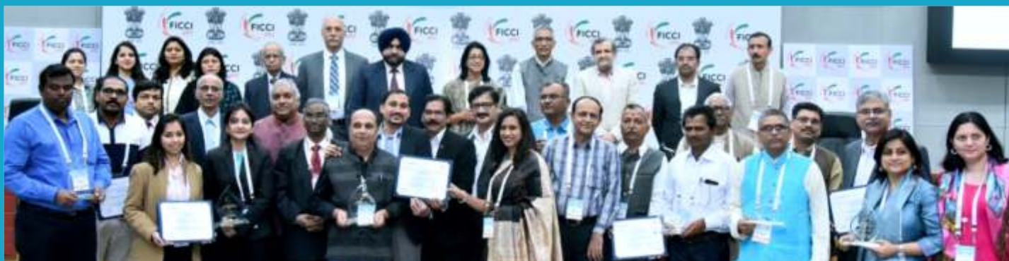
Winners of 5th Edition of the FICCI Water Awards