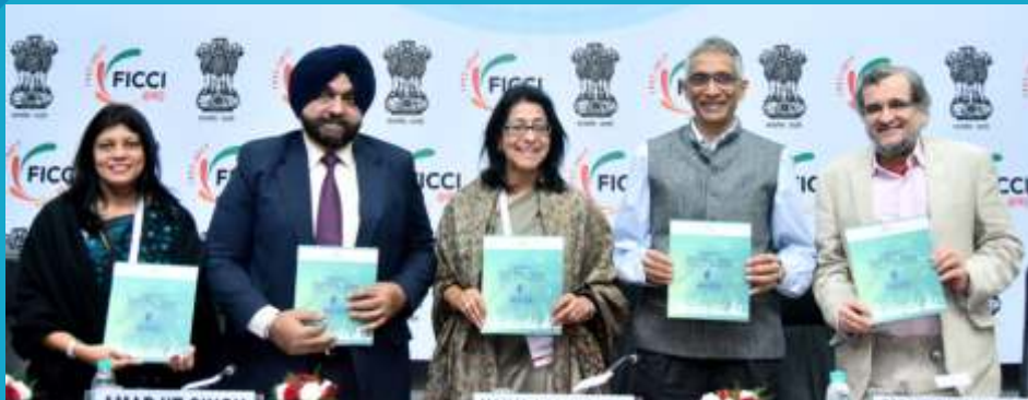
Release of Compendium of Best Practices