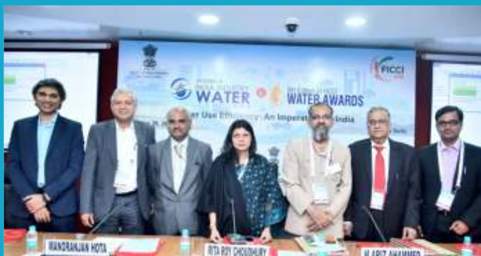
3rd Edition of India Industry Water Conclave