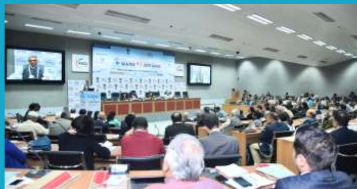
Inaugural Session of the India Industry Water Conclave and FICCI Water Awards