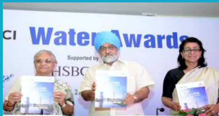
Launch of Knowledge Series during the FICCI Water Awards