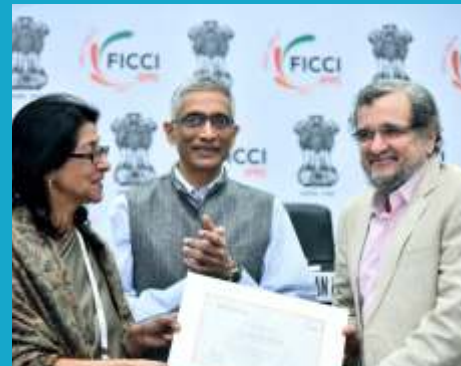
Honouring the Chair of the Jury, FICCI Water Awards